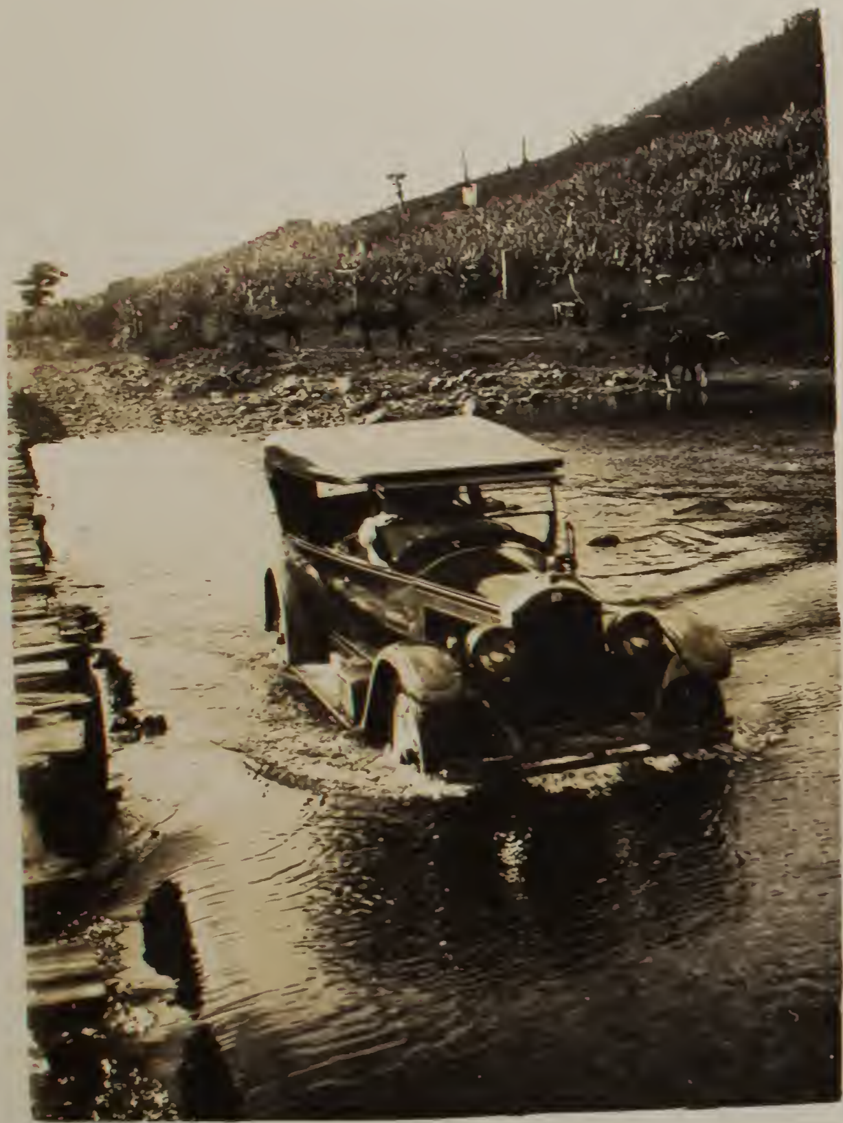
Freshwater Tank 15 in 27